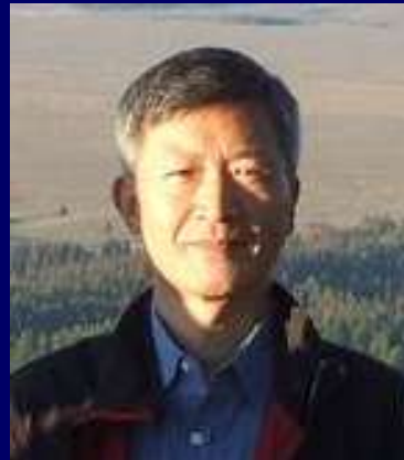
San Duanmu Linguistics